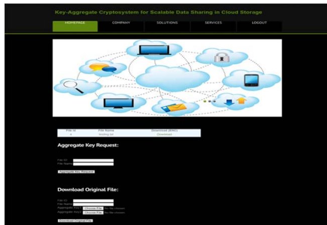
e)sending aggregate request