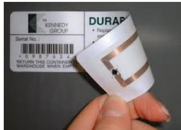
Fig 3: RFID tags implanted on equipments

2.1 RFID tags are always fixed with the objects and for tracking the object it should come in line of sight or placed at some measurable range of reader. The tags are automatically activated when they come in the range of radio frequency signals coming from the reader. It starts sending the information back to the reader.