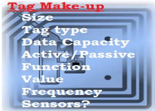
Fig 2: Information contained in RFID Tags

Another tag UHF tags are important in tracking and identifying patients, inventory management of medical items and medical devices.UHF is useful for determining the movement of patient and if required it can set up geo-fencing also.